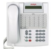
PARTNER 34-button display phone