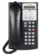
PARTNER 6-button display phone