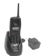
PARTNER wireless phone