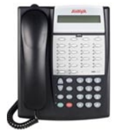
PARTNER 18-button display phone